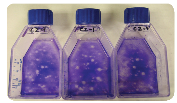
Plaque assays to detect and quantify infectious coxsackieviruses in water before and after treatment

the advanced oxidation process titanium dioxide photocatalysis for the conversion of organic phosphorus into the more readily removable inorganic species. These efforts contribute to satisfying increasingly stringent environmental nutrient requirements.